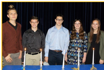
National Honor Society inductees

In eleventh and twelfth grades , students have more flexibility in their course choices. In addition to US History II and Government, American Literature, British Literature with compositional writing, Physical Education, and Art History and Music History (one semester each), students may choose their math and science classes to best-fit their future goals. Math classes offered include Pre-Calculus, math-based Physics, and Consumer Math. Science classes include Chemistry, Anatomy and Physiology, Forensics, and Environmental Science. Electives include Personal Finance, Psychology, Art Portfolio, Digital Arts, Yearbook, Drama, Praise Team, and Chorus. Biblical studies for our juniors and seniors focus on ethics and apologetics.